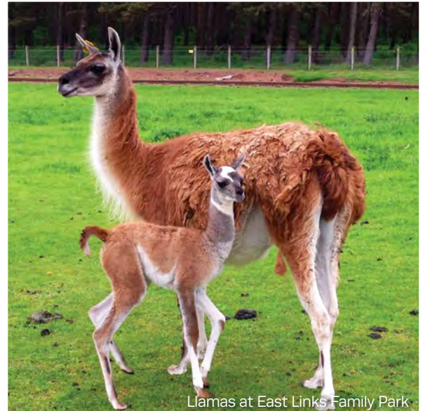
Llamas at East Links Family Park

Multi-generational tours can work well in the region with all the activities, boat trips and wide open spaces.