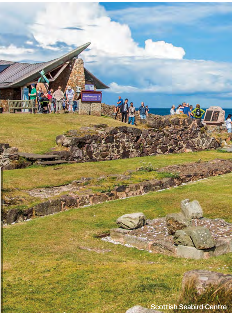
Scottish Seabird Centre