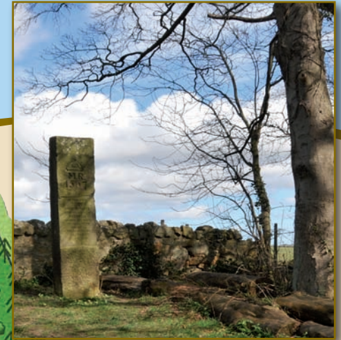
The commemorative stone at Queen Mary's Mount