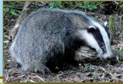
Badger and blue tit

Follow the signposts to enjoy a walk around this special place. Take time to look and listen for wildlife - you never know what you might see or hear. The paths can be muddy, so be sure to wear appropriate footwear.