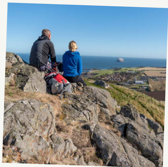
North Berwick Law

Upon reaching Tantallon Castle, your final climb will be its cliffside towers for spectacular views of Bass Rock and the East Lothian coastline. For tired legs, there's a bus service back to North Berwick from the bus stop at the end of the castle driveway.