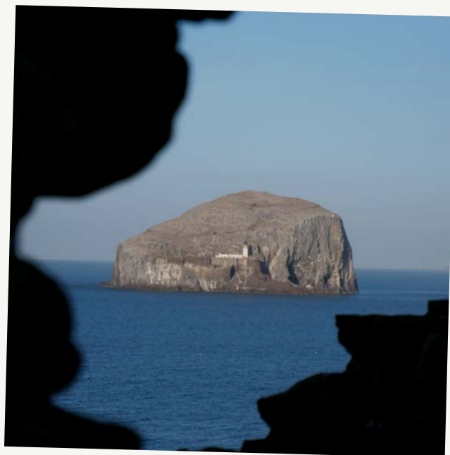
View of Bass Rock