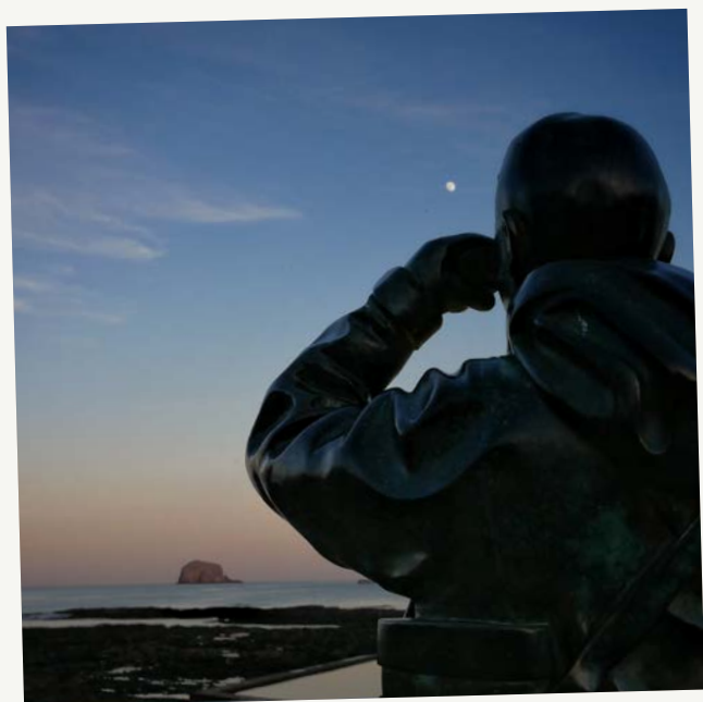
Bass Rock from North Berwick

Go for a paddle and build a sandcastle at this fantastic beach with its golden sands and views over to the island of Fidra. Its rich dune grassland is also host to a multitude of plant and animal life.